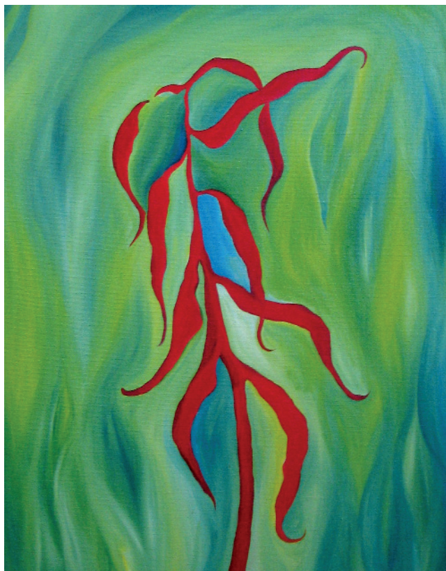
RED PLANT , 2005. 24 x 16 inches. Oil on canvas.