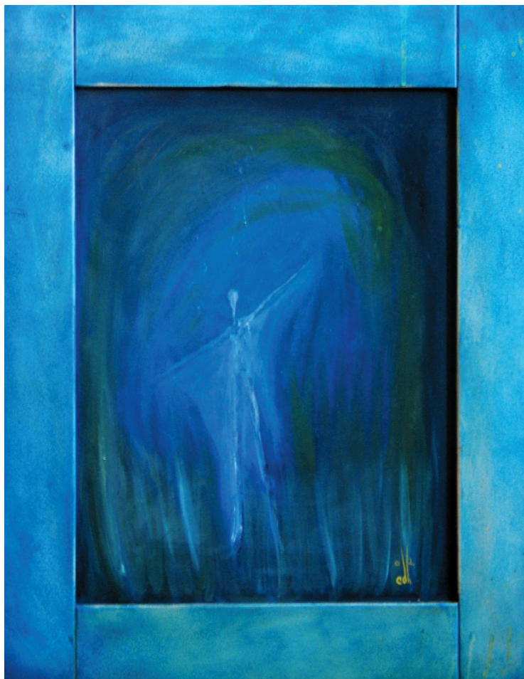
LOST WOMAN , 2003. 48 x 48 inches. Oil on canvas.