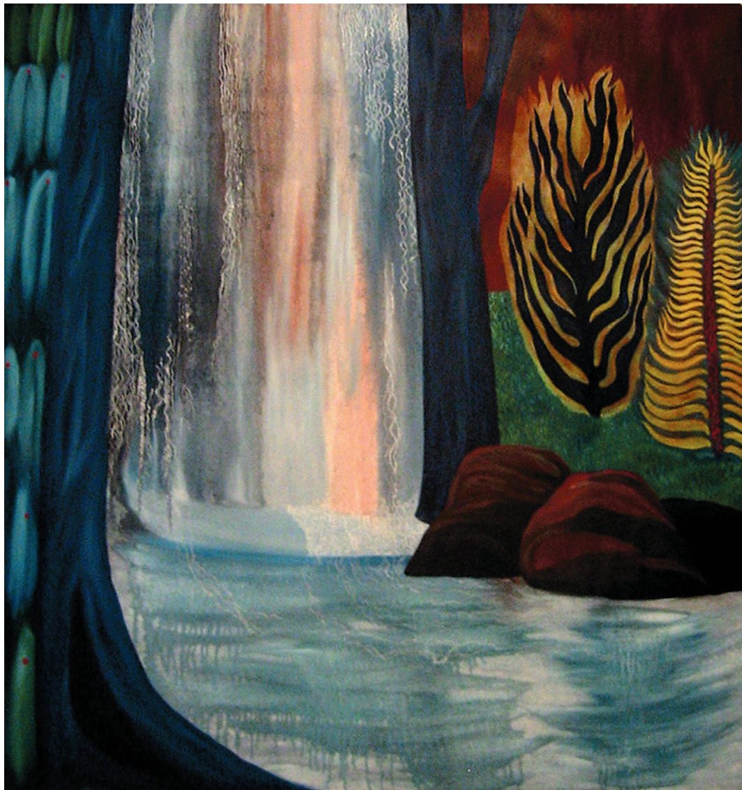
WATERFALL , 2000. 64 x 55 inches. Oil on canvas.

All images provided courtesy of the artist, Callie Danae Hirsch.