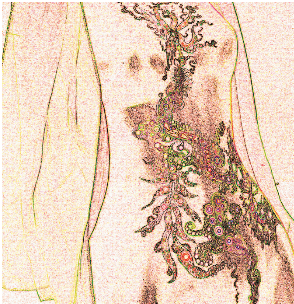
BODY ART , 2005. Photograph.