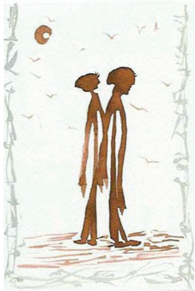
CHARLOTTE'S WEB , 2002.