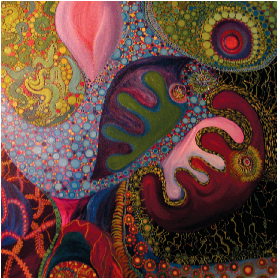
TWO EYES , 2001. 24 x 24 inches. Oil on canvas.