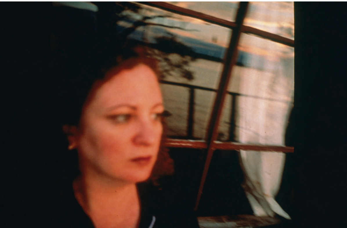
Figure 7 Clinic at the Hospital, Belmont, Mass., 1988