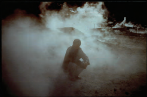
Figure 5 Positive Grid II, 1993 – 2002/2003